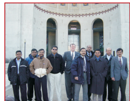
Digitek team at The Ohio State University